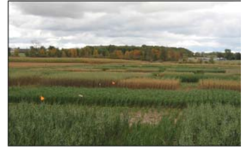
Figure. Optimum planting dates for early and late maturing fall-grown oats.

Photo. Four oat cultivars, planted in late summer, were evaluated for yield and nutritive value based on three different planting dates