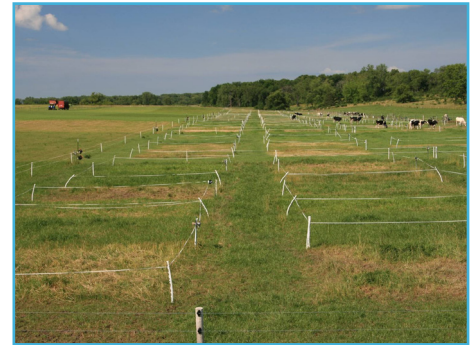
Photo. Pasture research plots at USDFRC were used to study the effect of residue height and timing of grazing with four different grasses grazed under five management systems.

Sample calculation of value: (4500 lb/ac)/(150 days/ac) x (45 lb milk/day) = 6750 lb milk/ac (67.5 cwt milk/ac) x ($18.80/cwt milk) = $1270/ac