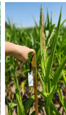
Corn Tasseling at 4 ½ ft. Tall